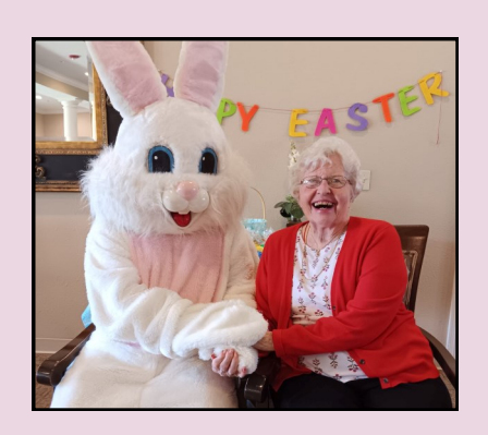
Hope you had a Hoppy Easter!